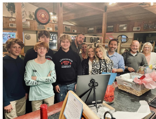
WACM chicken dinner at Crandall's

Thank you to the congregation at First Presbyterian for the support you provide to WACM. Members attended the Crandall's chicken dinner fundraiser, donated coats and other winter gear which were distributed to community members in need and contributed financially to help fund the Direct Assistance Program (DAP).